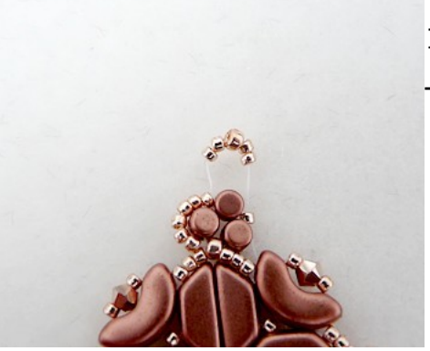
15 Then 2 R15, 1 R11, 2 R15 in the R15