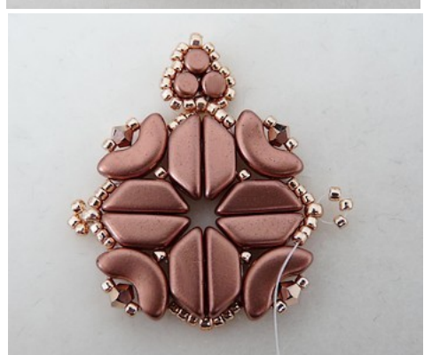
18 Pick up 3 R15, finish in the R11