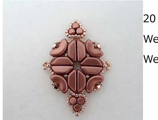
We have this