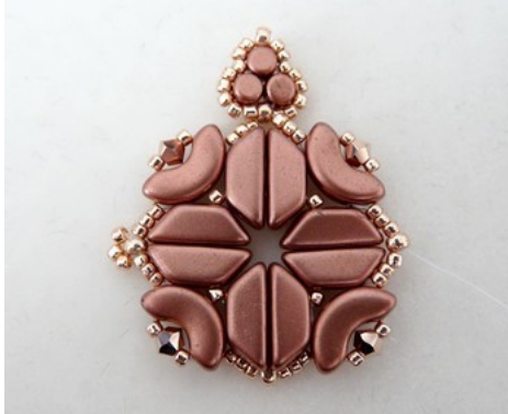
17 We have this