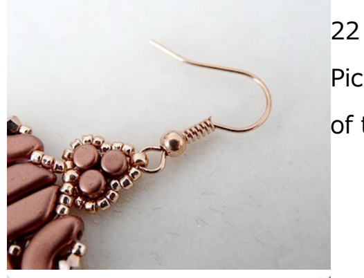
Pick up your earring with a ring at the oposite of the teardrop, in the R11