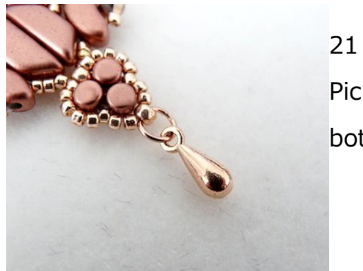
Pick up a teardrop with a ring in the R11 at the bottom