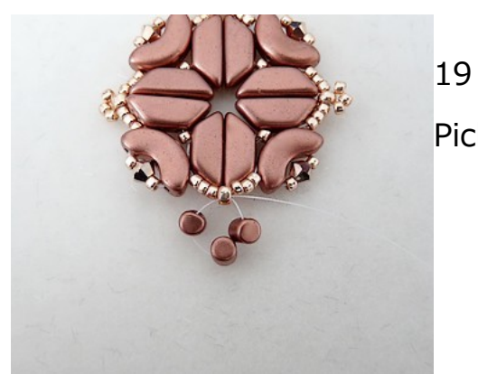
Pick up 3 Minos like step 11 to 16