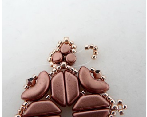
16 Pick up 5 R15 in the R11